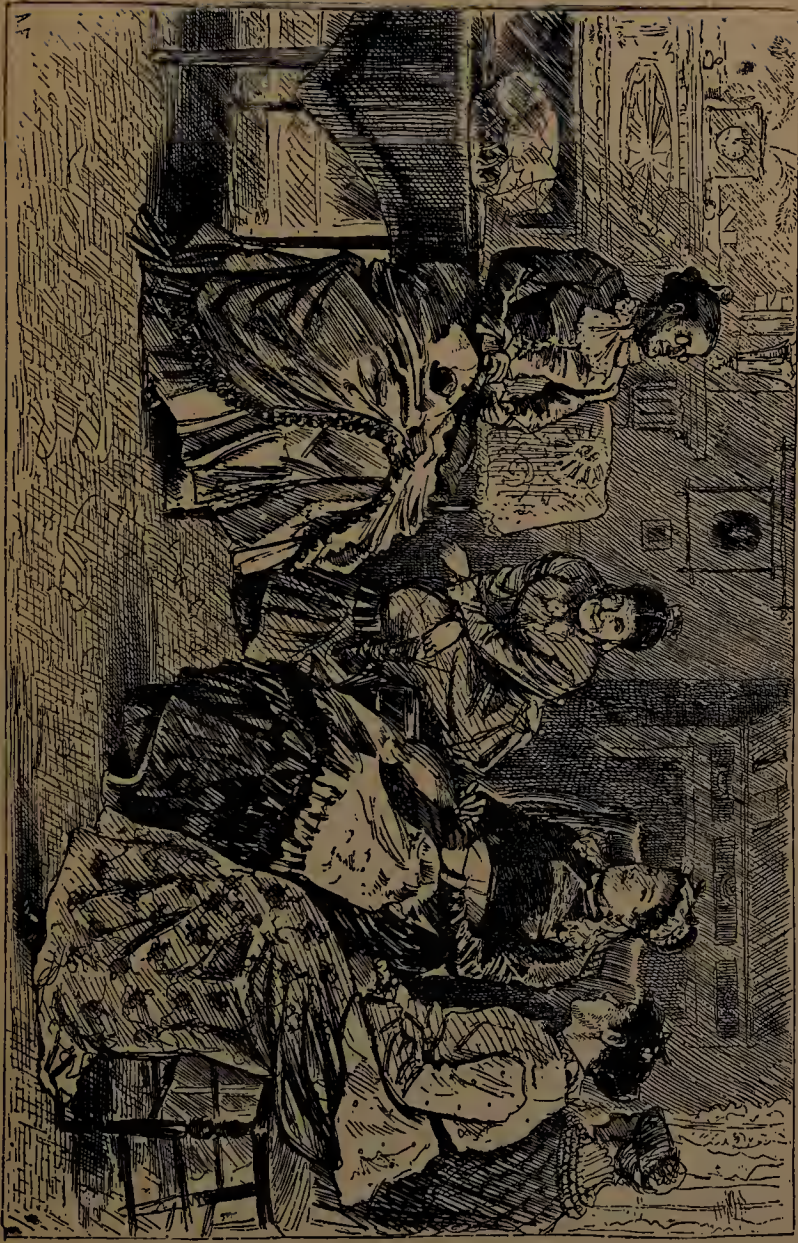
“THE WOMEN PLY THEIR KNITTING-WORK”